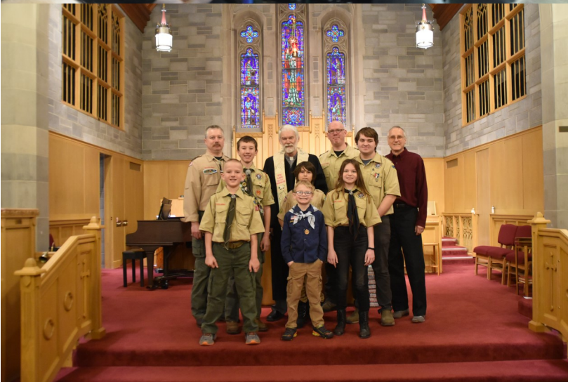
BELOW: Another photo from Scout Sunday.